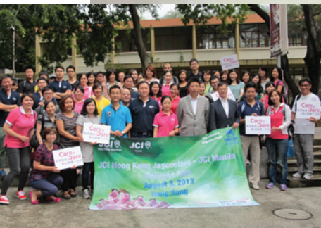
↑ Organization of Refugee Run with JCI Manila

Chanting 'Care to Dare, Dare to Care', we embarked on an exciting journey to walk hand in hand with members of the community and to strive for positive changes.