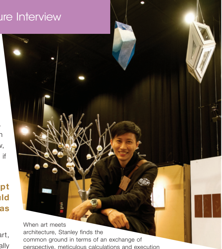
When art meets architecture, Stanley finds the common ground in terms of an exchange of perspective, meticulous calculations and execution

For the public at large, what they see is a building established. As early as the stage of master planning, we already need to consider how to best align the building with the surrounding environment and periphery facilities, on such aspects as to the direction for the façade to face the sun for solar energy. When drawing a diameter of 100 meters, the question rests on how many public transport means are available for this site. If it can be measured, then we need not design so many car parks. It also comes to the issue of selection of materials. When a building completes construction, we can measure the carbon footprint generated. Using materials from the local region can reduce both the transportation costs and carbon footprint. We also focus on the certification of the materials, as to whether the materials are come from parties that are environmentally