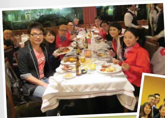
Enjoying the trainings all day with JC members all around the world