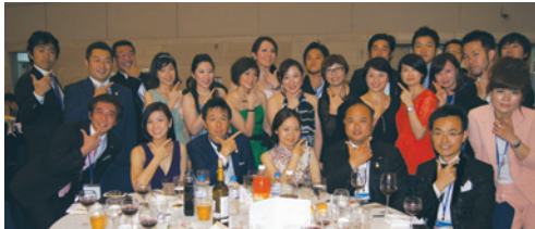
↑ Gala with JCI Yokohama