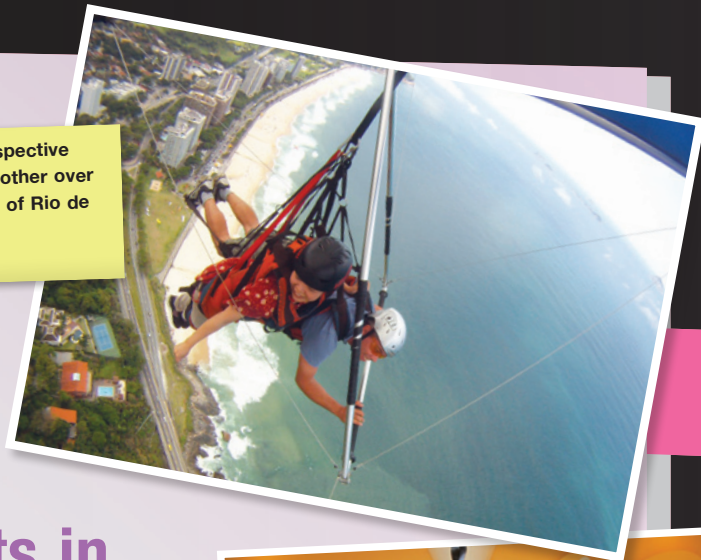
A new perspective unlike any other over the skyline of Rio de Janeiro