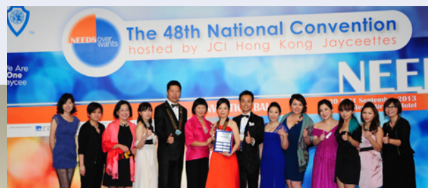
↑ Care & Dare team won the Best UNMDG Project Award in 48th National Convention