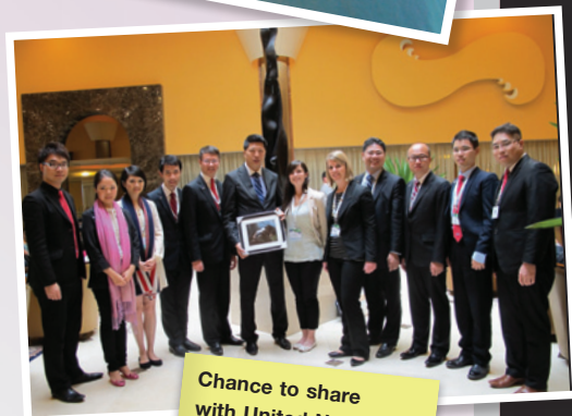
Chance to share with United Nations of Foundation representative