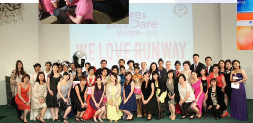
← Group photo of award panel, facilitators and models after two months of aspirations, nothing is impossible with passion!