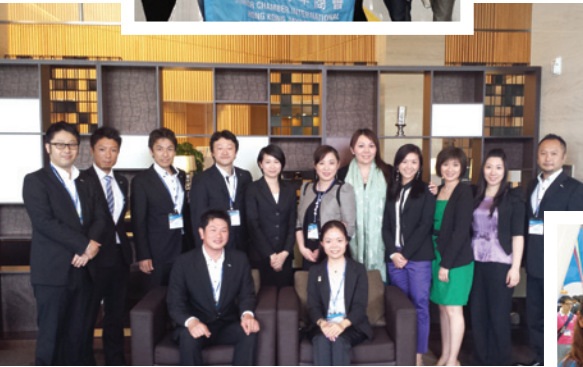
↑ An exchange of ideas with JCI Toyota