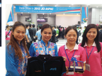
↓ Exchange of gifts with JCI E-metro