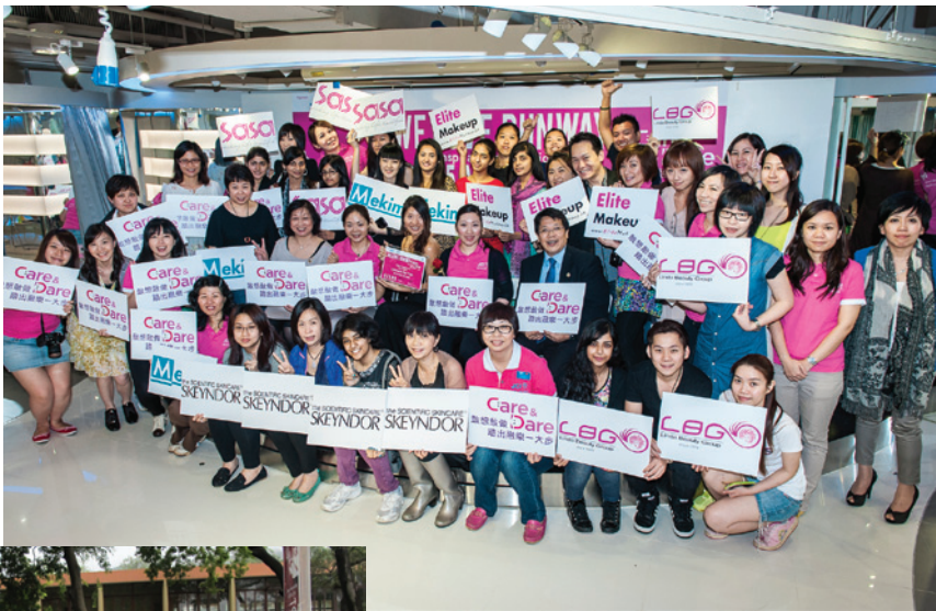
← Inspirational Session of We Love Runway and bestowing support from CPA HK, ethnic youths and designers