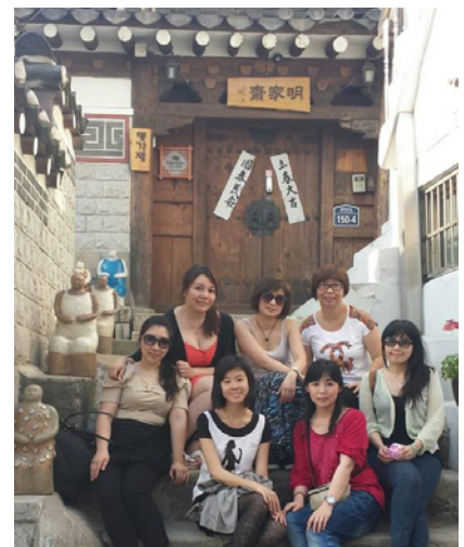
↑ Jayceettes immersed in the culture of Korea after ASPAC

The most memorable thing in Gwangju would be the debate championship competition for JCI HK had become the finalist in the competition and I am very