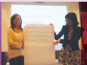
Group sharing of social problems in society