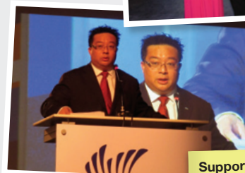
Support of PNP Senator Ken Wong at General Assembly Caucus session