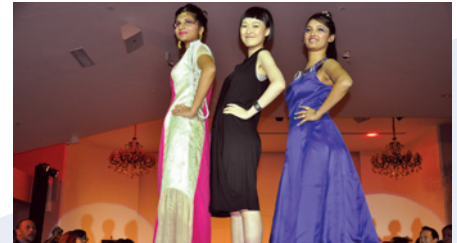
↑ After 2 inspiration sessions in May and June, 12 young, vibrant ethnic models from Caritas HK, staff and cosmetic professionals from Skyendor Hong Kong, Elite Make Up, Linda Beauty Group, Mekim Limited and Sasa International Holdings Limited, local designers and Jayceettes facilitators went on the runway on the same vision of helping refugees worldwide