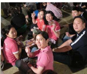
↓ Participants brainstormed what's next with JCI Manila after experiencing the hopeless situations of refugees

Through our true life experiences, we felt the urge to stop the crisis and resolve the difficulties faced by the minorities in the society. With a step forward together, we hope to bring a little positive change, not only to ourselves, but also to the world.