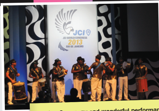
Opening Ceremony and wonderful performance, welcoming guests coming after hours of flight