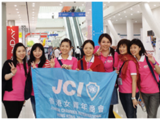
← Snapshots of Jayceettes and first timers in ASPAC