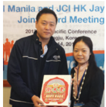
↗ Exchange of Souvenirs with JCI Manila President in the Joint Board Meeting in ASPAC

Other than attending the meetings, trainings and national parties, we also met with sister chapters and friendship chapters where members enjoyed sharing the local projects held and have meeting on the arrangement of holding our joint project-the refugee run on 3 August.