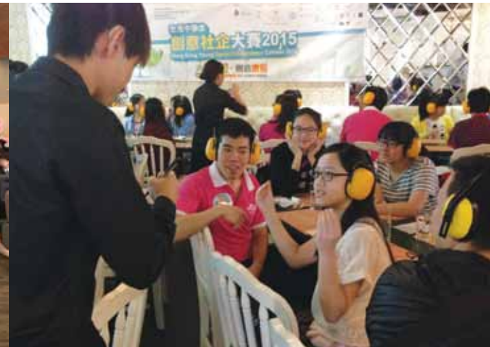
Students learning to order with sign language

Social Enterprise 社會企業 (SE 社企) has been getting more public attention over the past decade. To better educate the younger generation and further promote social innovation to the community, Business Affairs Area this year initiated the first-ever SE Business Plan Competition for secondary schools: Hong Kong Young Social Entrepreneur Contest 2015.