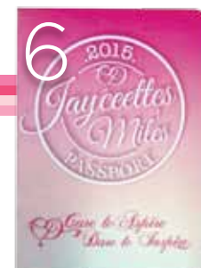
Jayceettes Miles & Jayceettes Development