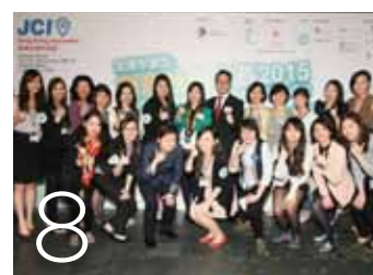
Hong Kong Young Social Entrepreneur Contest 2015