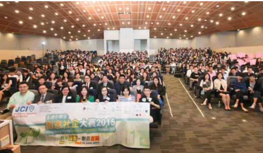
Over 400 participants attended the Opening Ceremony of Hong Kong Young Social Entrepreneur Contest 2015