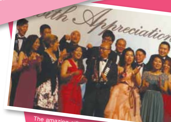
The amazing gift on 9 May-birthday song from 800 guests in JCIHK 65th Anniversary