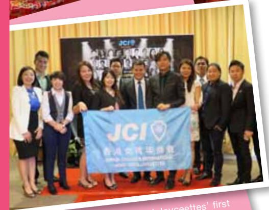
Pre-ASPAC visit of Sabah and Jayceettes' first visit of different chapters in Sabah at 2014 JCI Area Sabah Appreciation & Awards Ceremony