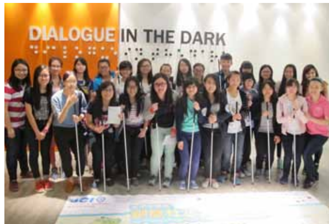
Visit at Dialogue in the Dark