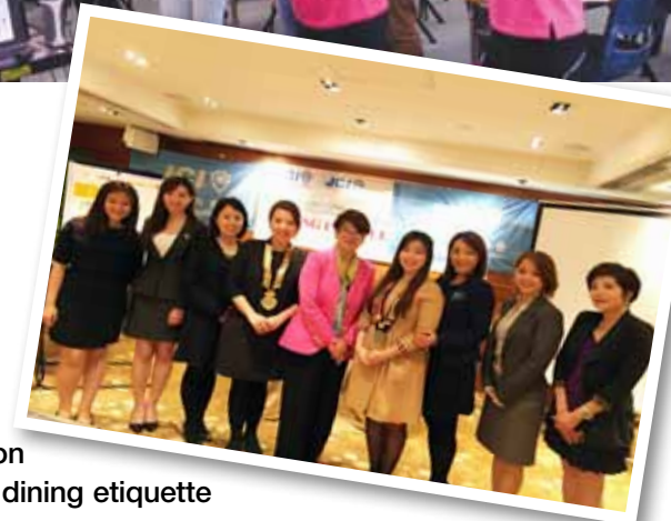
First-ever collaboration with JCI Bauhinia on dining etiquette