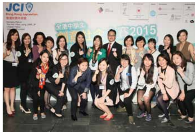
Jayceettes supported at Opening Ceremony