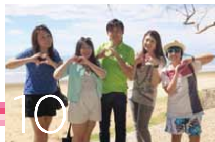
We Connect • We Love • We Aspire