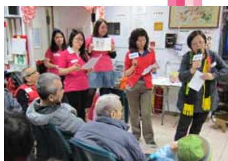
Jayceettes singing to the elderly

This visit was held successfully with the involvement of members, volunteers and the hard working organizing committee. But it was just a kick-off and more will be held in the coming future.