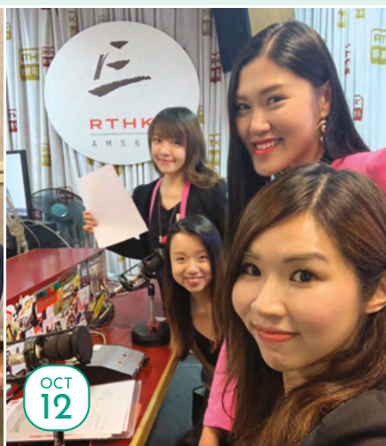
RTHK Radio 3 "The Saturday Squad"