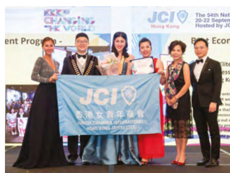
Best Economic Development Program (Merit) Female Elites' Series 2019: Business On Stilettoes