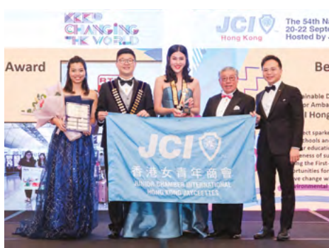
Best Global Goals Project Award SDG Junior Ambassador Programme 2019