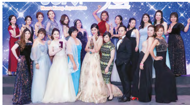
2019 Board of Directors at the 50th Anniversary Banquet