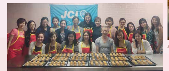
September - Mooncake Making Class