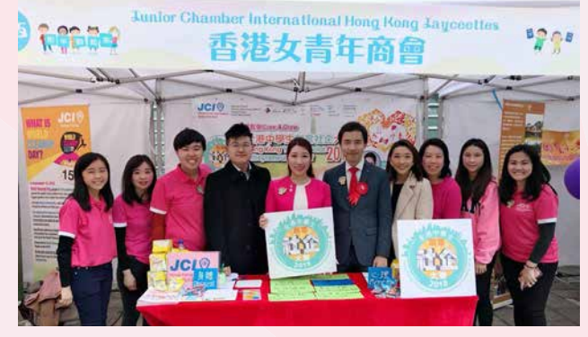
March 2 Promotion Video & Interview With Project Ambassador

We were invited by UNESCO Hong Kong Association to promote both the Contest and the United Nations Convention on the Rights of Persons with Disabilities to Hong Kong citizens through interactive games.