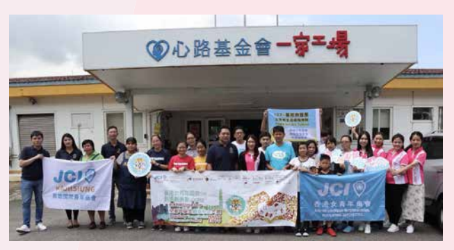
August 5 Interview by Local Radio Channel RTHK

The Champion team paid a visit to Kaohsiung, Taiwan in late July. Students visited several local social enterprises and NGOs to learn about their operations and services. Special thanks to our sister chapter JCI Kaohsiung for the hospitality.