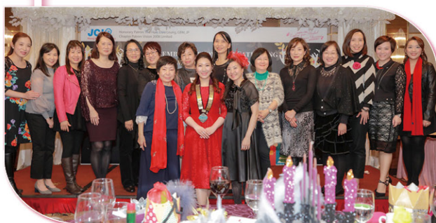
Handover of Presidential Chain in 2017 December Fellowship Gathering with the witness of Past Presidents